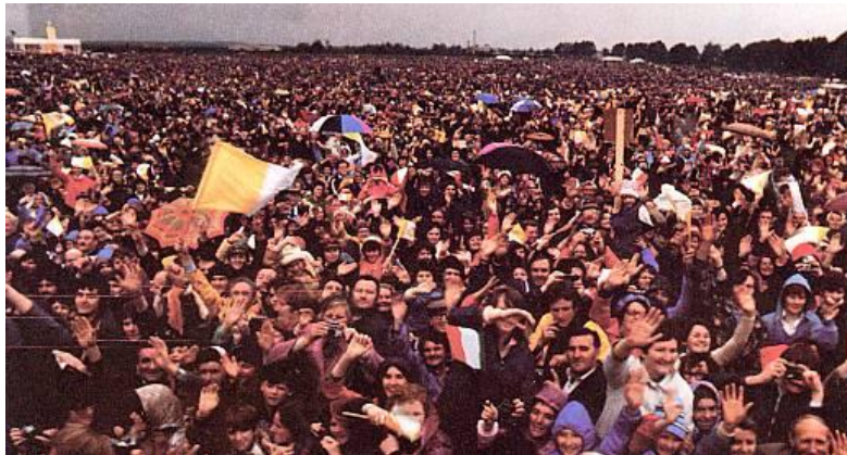
A section of the gathering in Limerick on October 1 st 1979

The first visit of a Pope to Ireland would have been an extraordinary occasion in any case. But, in spite of all the preparations and the weeks of anticipation, nobody realised how overwhelming the event would prove to be. The Pope's evident conviction, his warm, energetic presence and the strength of his desire to communicate with us had an impact beyond anything we had expected.