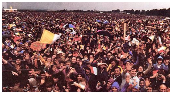
John Paul II in Limerick

The Eucharist is not only the summit but also the source of our lives. In other words, the Eucharist sends us out to live with new purpose and strength: “Entering into communion with Christ in the moment of his Pasch also means sensing the duty to be a missionary of the event made present in that rite” 34 . In Limerick, Pope John Paul told us that there is no such thing as an ordinary layperson because, “As God’s holy people you are called to fulfil your role in the evangelisation of the world” 35 .