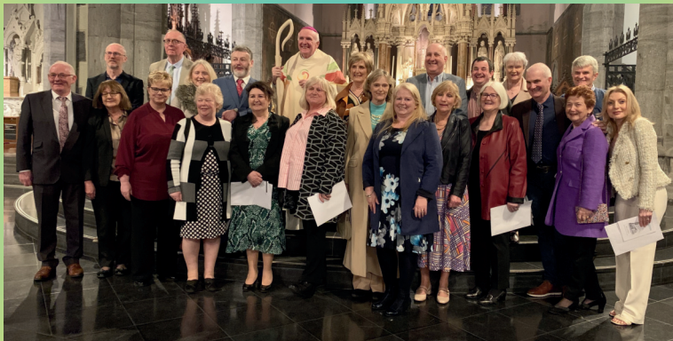
'Sending Forth' Limerick Class of 2020-23